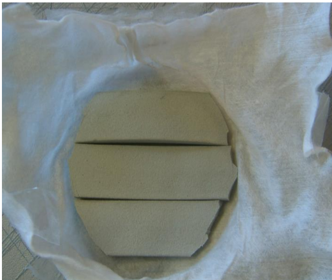
Fig.3: Cleaning cloth on the rubber