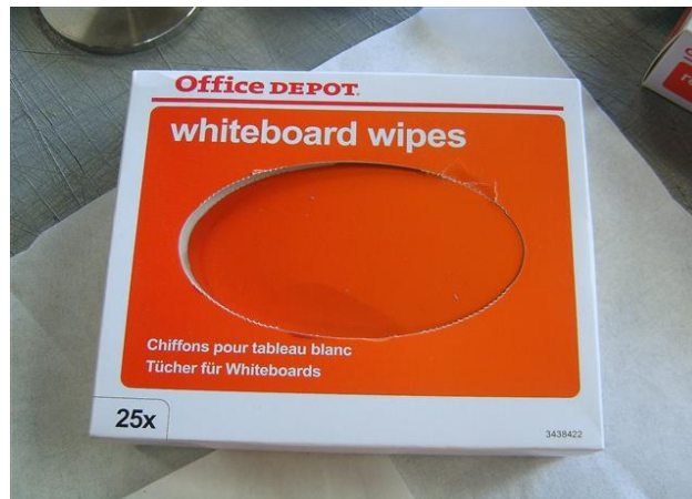
Fig.2: Whiteboard wipes

To simulate a long-term use of a whiteboard, a typical whiteboard cleaning cloth (fig. 2) on a sponge rubber (fig. 3) was applied to a Martindale station (fig. 4). With the Martindale machine a force of 10N was applied and the test was done 6 times summing up to 10000cycles.