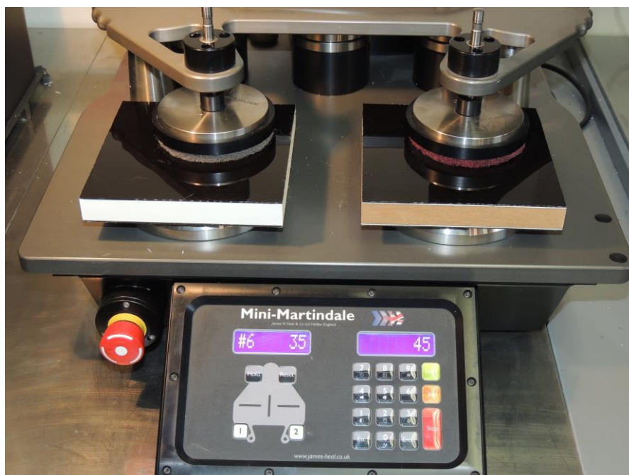
Fig.1: Martindal test unit

In the martindale test unit, an abrasive material is moved by defined load and defined cycles against the surface of the test pieces. After the test, there are two ways to analyse the resistance of the surface. Measure the loss of gloss and visual assessment.